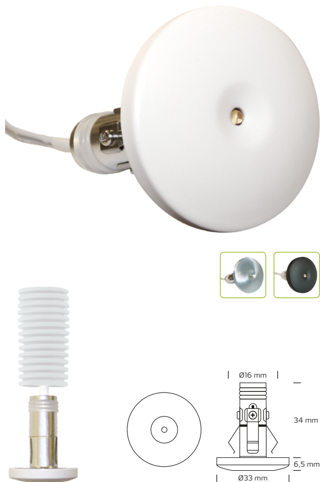
*The drawing is not drawn to scale